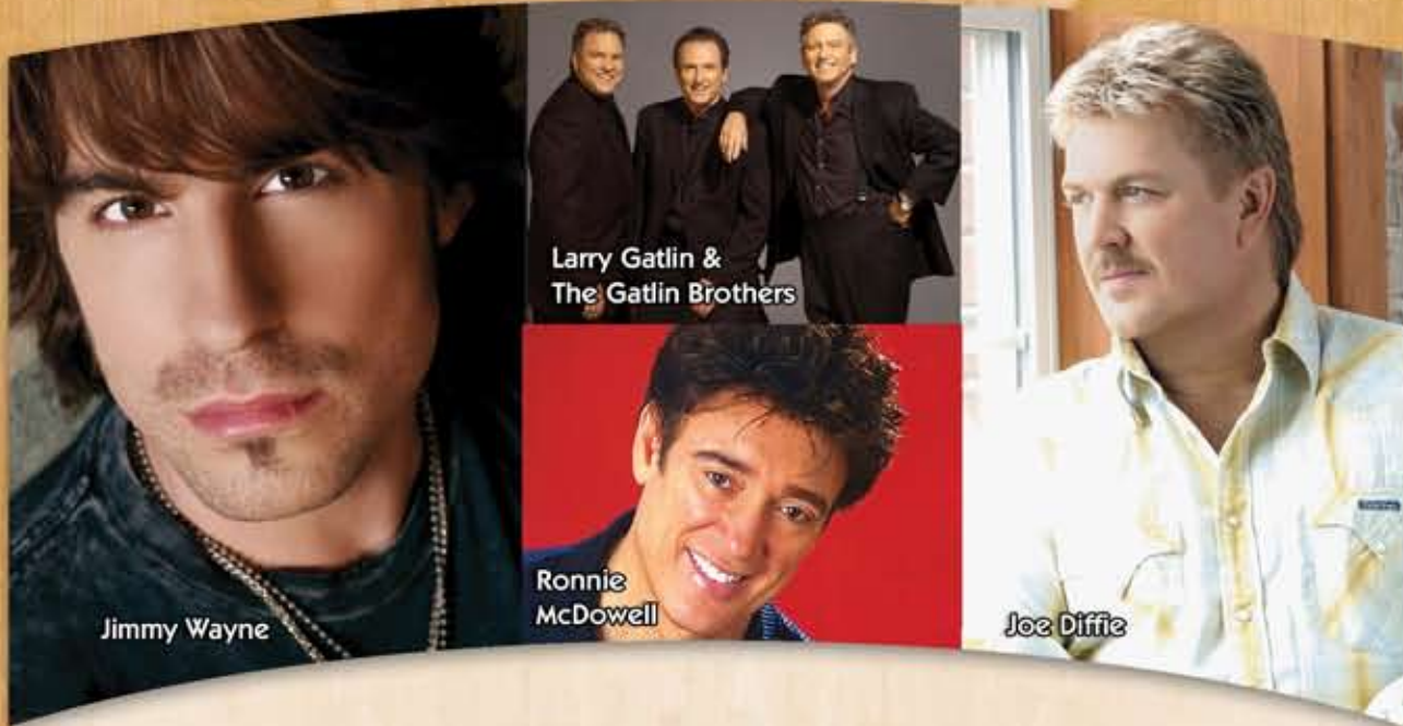
Larry Gatlin & The Gatlin Brothers